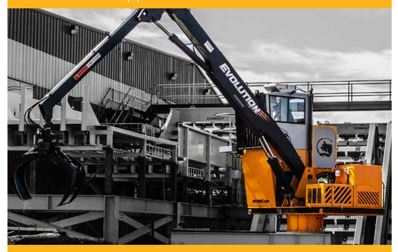
SM-W Power Unit: On loader | Operator Station: Remote

SM-X Power Unit: On loader | Operator Station: On loader