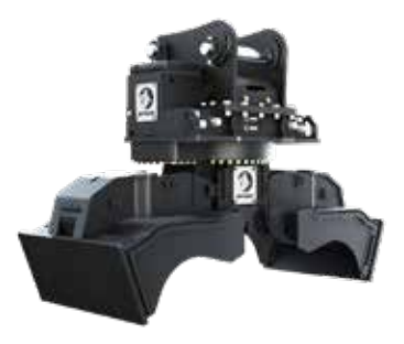
RPA - TRASH COMPACTION