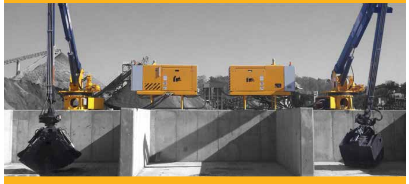
SM-H Power Unit: Remote | Operator Station: On loader